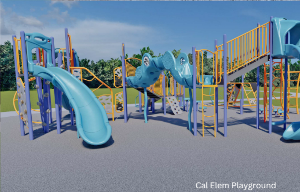
Cal Elem Playground

of our bond projects. Note: All renderings are conceptual representations.