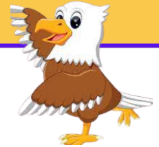
Table Talk :

Safety, Ongoing Kindness, Act Responsibly, Respect