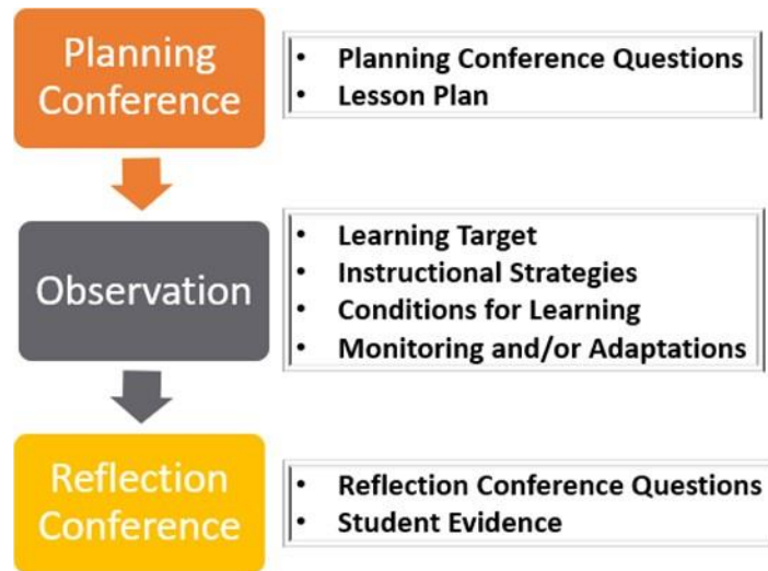
Figure 5: Process Overview for Classroom Observation